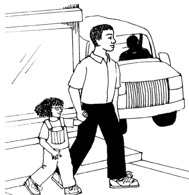
Hold hands with a child near streets or in parking lots.

Set a good example by following safety rules. Use crosswalks, when available.