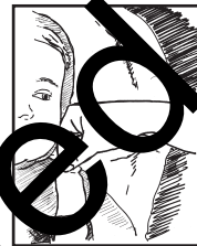
Pinch test for snug straps